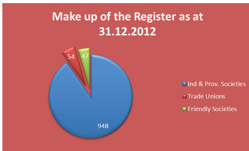
Fig. 1: Ratio of I&P Societies, Friendly Societies and Trade Unions at end 2012.

The charts below show the ratio of Industrial and Provident Societies, Friendly Societies and Trade Unions on the register at 31 December 2012, and over the years 2003 – 2012.